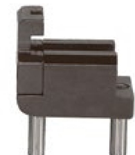
Adapter upper part