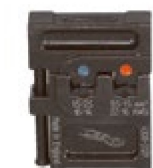
Crimp tool insert