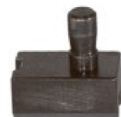
Adapter bottom part*